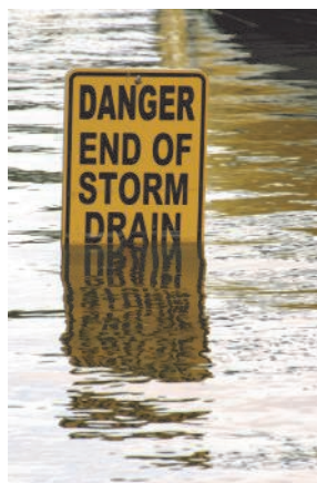
Milan: preparing for the worst—hoping for the best.

http://www2.mvr.usace.army.mil/WaterControl/new/layout.cfm